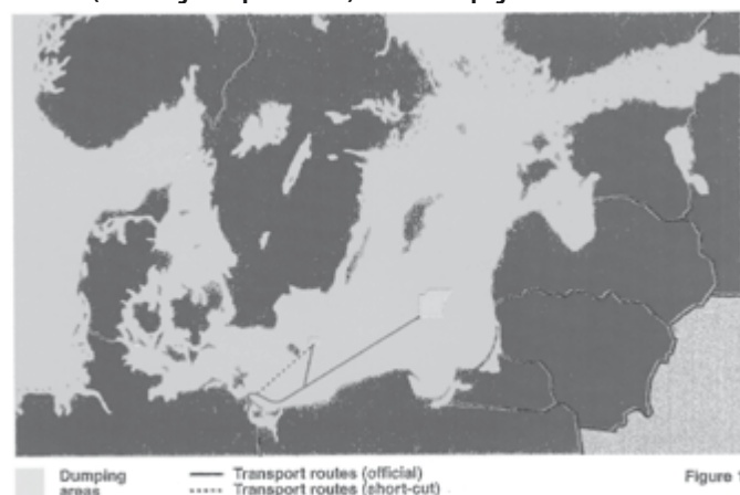
Figure 1. Map of dumping areas for chemical munitions in the Helsinki Convention Area (including transport routes) on the next page.

Information on other dumping areas in the Helsinki Convention Area has not been verified.